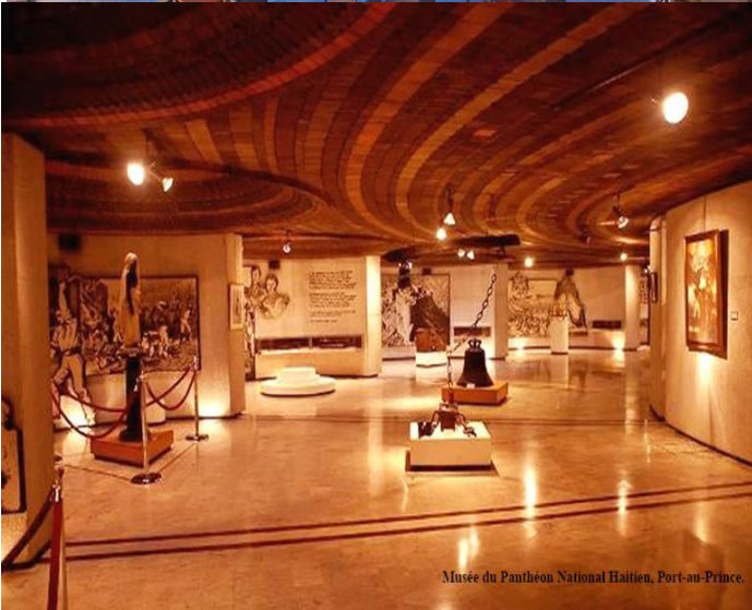
Musée du Pantheon National Haitien, Port-au-Prince.