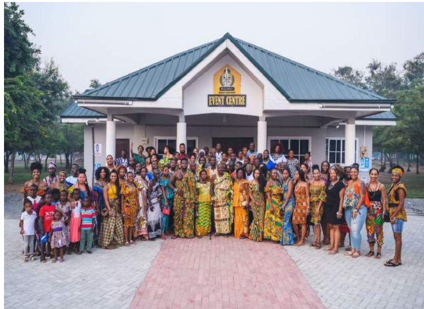
Gravel World in Ghana 2019 - Afrochella and the Year of Return Trip

TRIP PLANNING: Experience any of our curated trips on your own dates and with your travel crew. Or let us curate a new trip to anywhere in the world. Our trip planning services allow us to customize a trip for you based on your unique requirements. We plan everything from lodging accommodations, tours, dining, nightlife, and unique experiences based on your budget. Email us at info@gravelwrlld.com to get started.